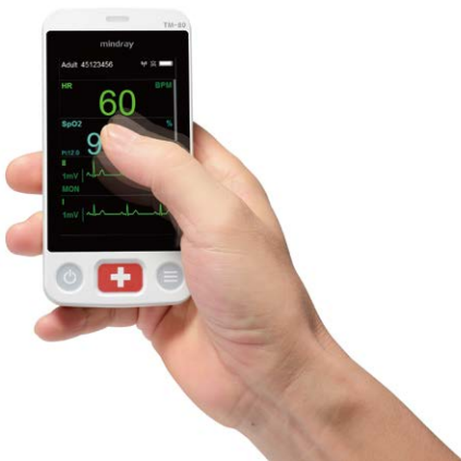
3.5" capacitive screen, operating like a phone, easy to learn.