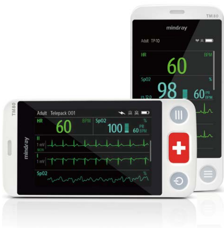
Landscape and portrait display mode, easy to read.